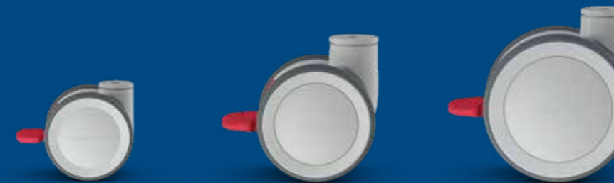
75 mm AVAILABLE